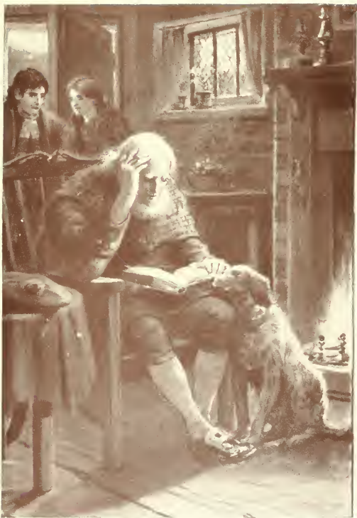
118 "The old man was seated by the fire" Page 126